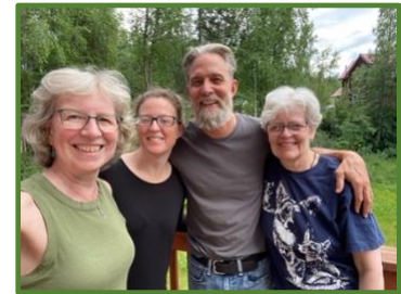
Part of the Sunday Clean-Up Crew