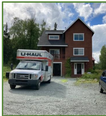
Goodbye to the Darby Rd. House