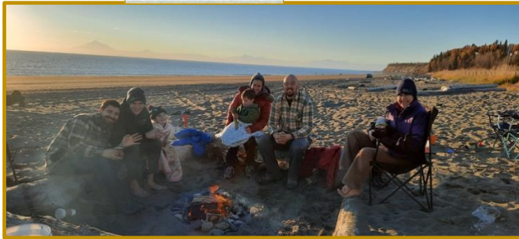
Fire on the Beach