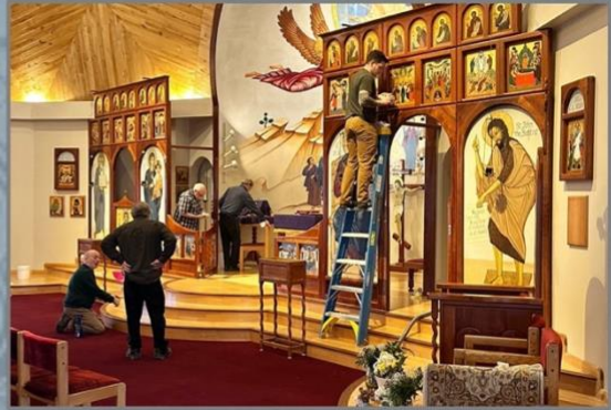
Cleaning Day 2025