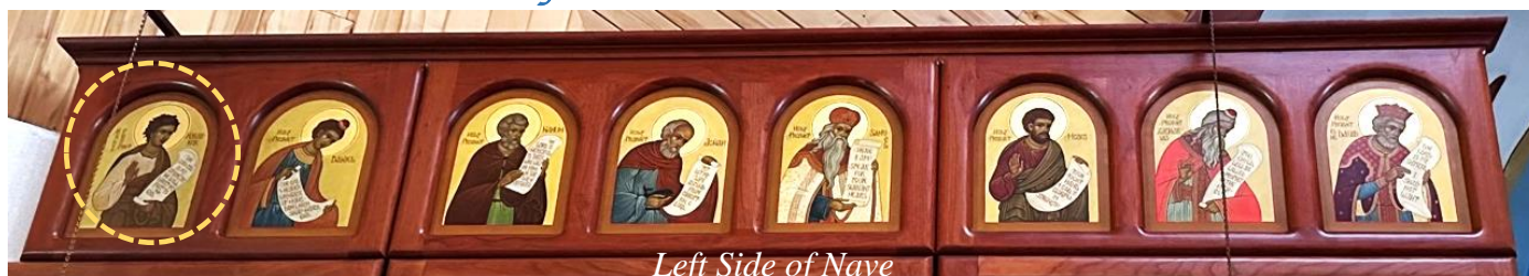
Left Side of Nave

Answers to your questions will be highlighted in the bulletin for the next several weeks.