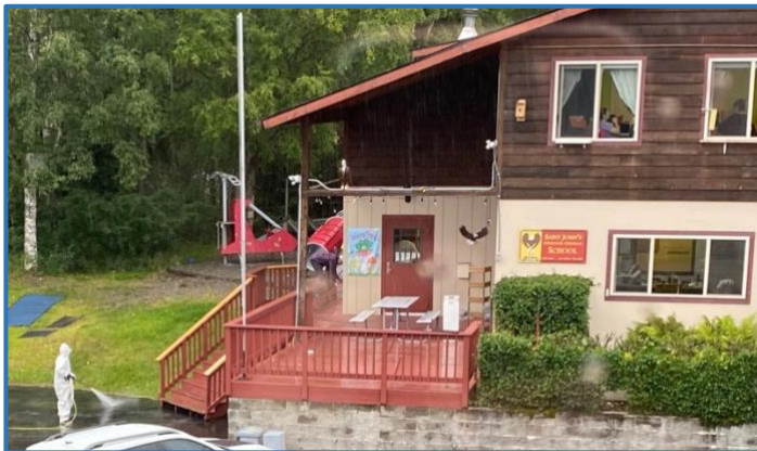
Preparations Have Been Under Way