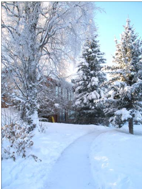
Saint James House, November 2005

My year at the St. James House was amazing in every sense of the word. Since